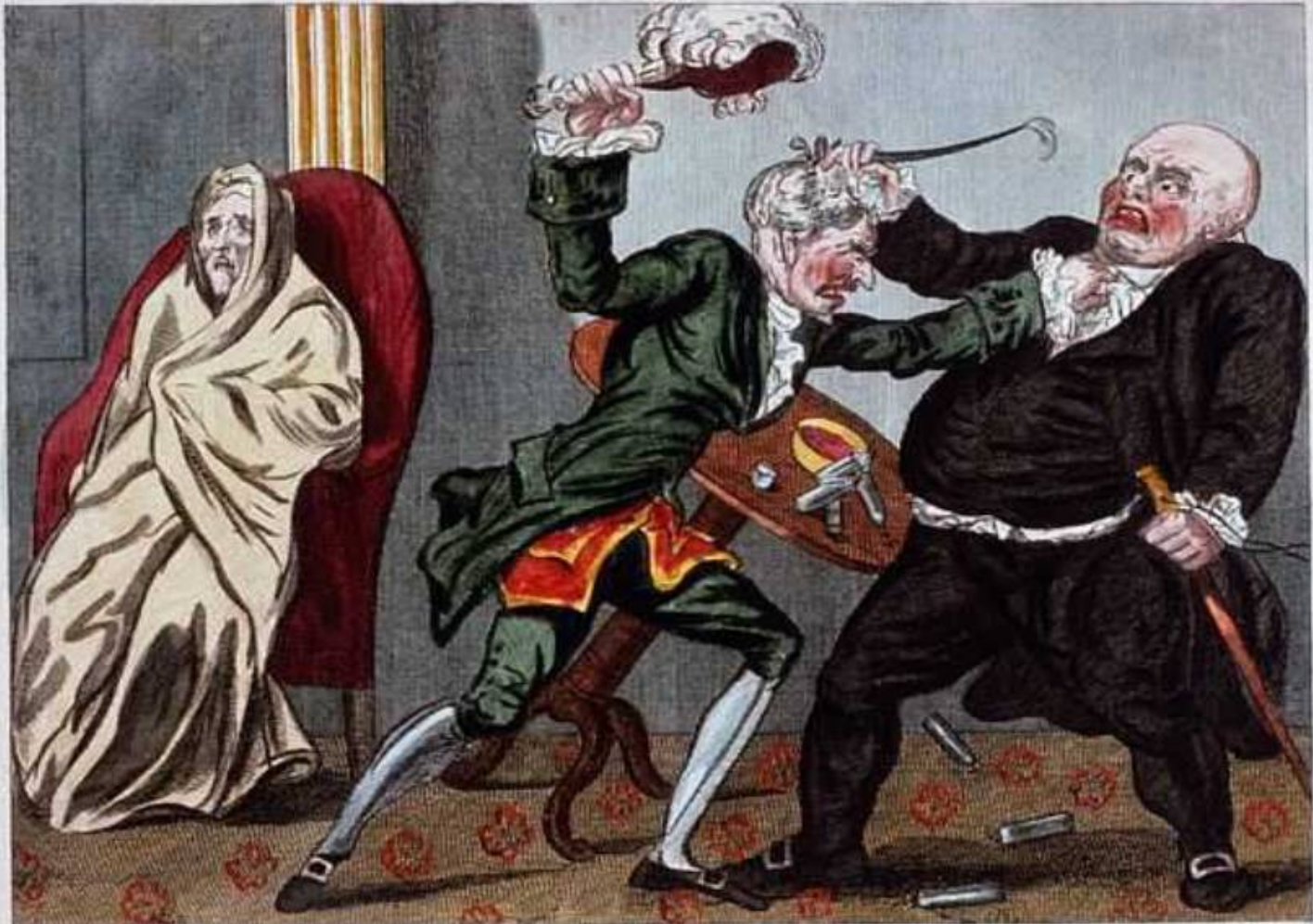
DOCTORS DIFFER and their PATIENTS DIE.